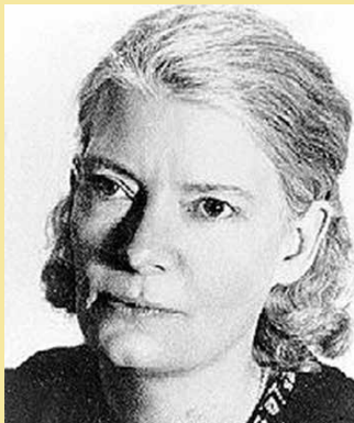
Dorothy Day, 1897 – 1980